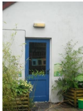
Barn Owls Year 3 and 4