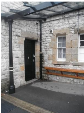
Snowy Owls Nursery / Reception