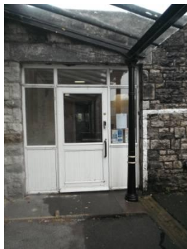
Tawny Owls Year 1 and 2